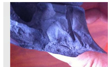
Inside section of blades white parts is carton fiber material