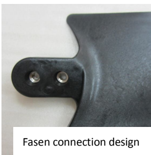
Fasen connection design

And we have made the rotor blades balance treatment, in order to keep it quiet and no vibration when rotating. We have made inside nuts fasten structure between blades and hub connection.